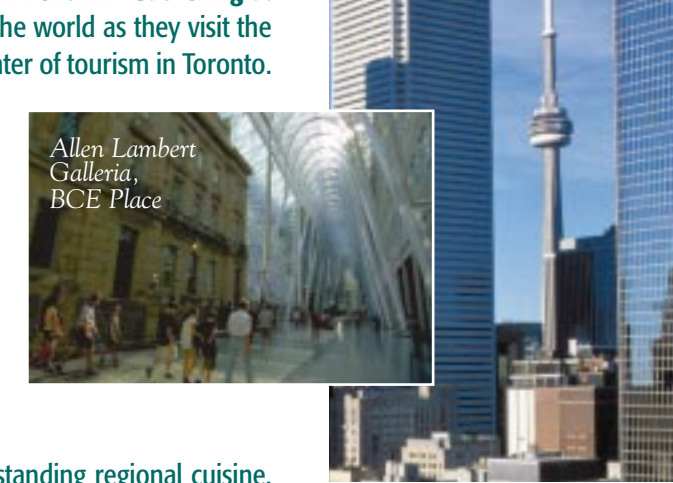
CN Tower, Downtown Toronto,

Organizers have planned an evening like none other, featuring outstanding regional cuisine, local wines and beers as well as stunning entertainment and great company.